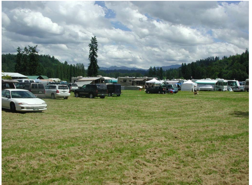
A day out in the Pacific Northwest!