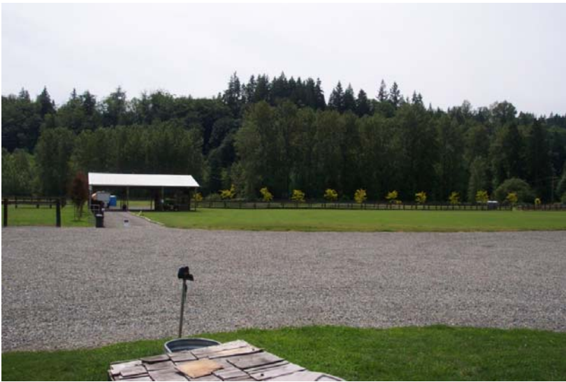
All roads lead to the Specialty!