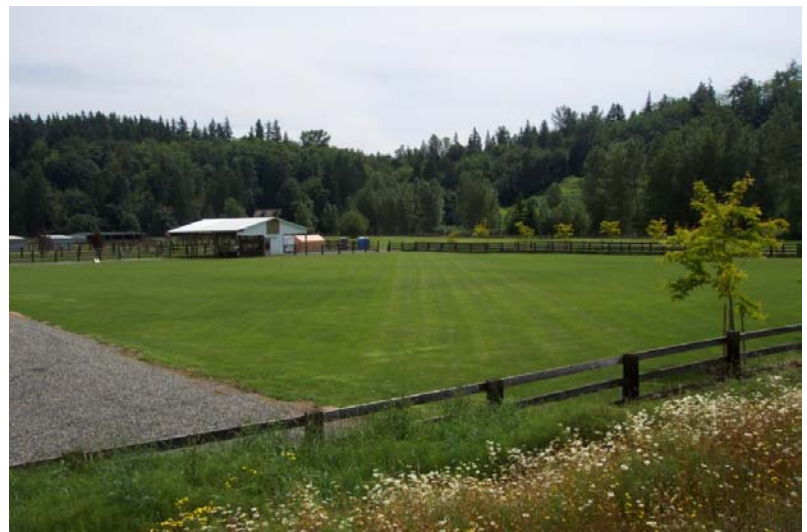
Conformation & Obedience field