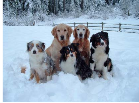
Windance Goldens & Mini Aussies Lori Langton