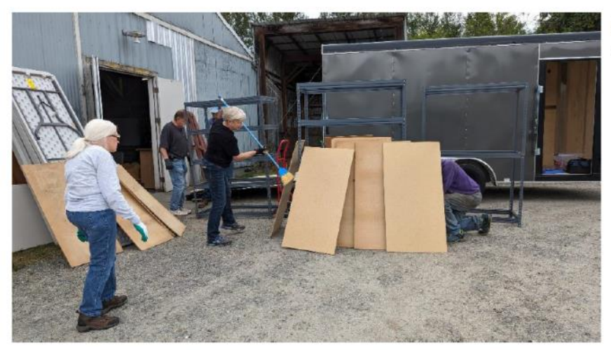
Removing and sweeping off all those extremely dirty shelves.