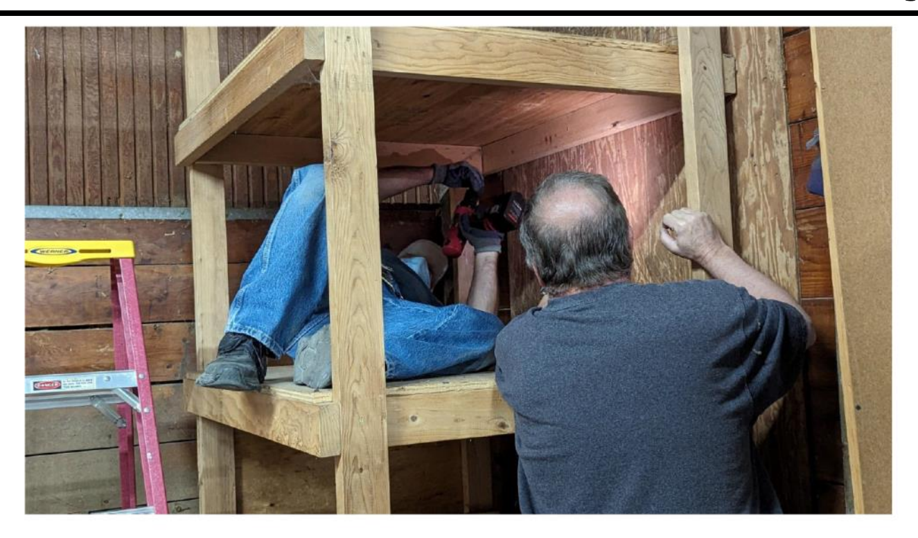
At Midnight we finally were moving out! Good-bye old storage unit!